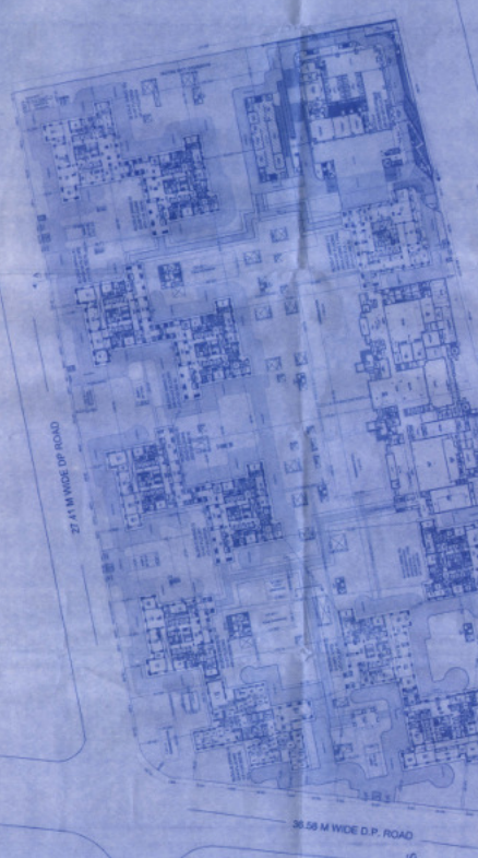
LINE DIAGRAM FOR PLOT AREA SCALE: 1:500