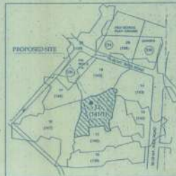
LOCATION PLAN SCALE: 1:5000