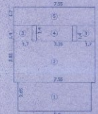
LIFT, LOBBY & STAIRCASE AREA DIAGRAM OF 1ST TO 14TH FLOOR