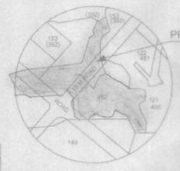
LOCATION PLAN SCALE: 1:4000