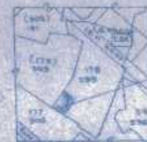
LOCATION PLAN SCALE - 1:500