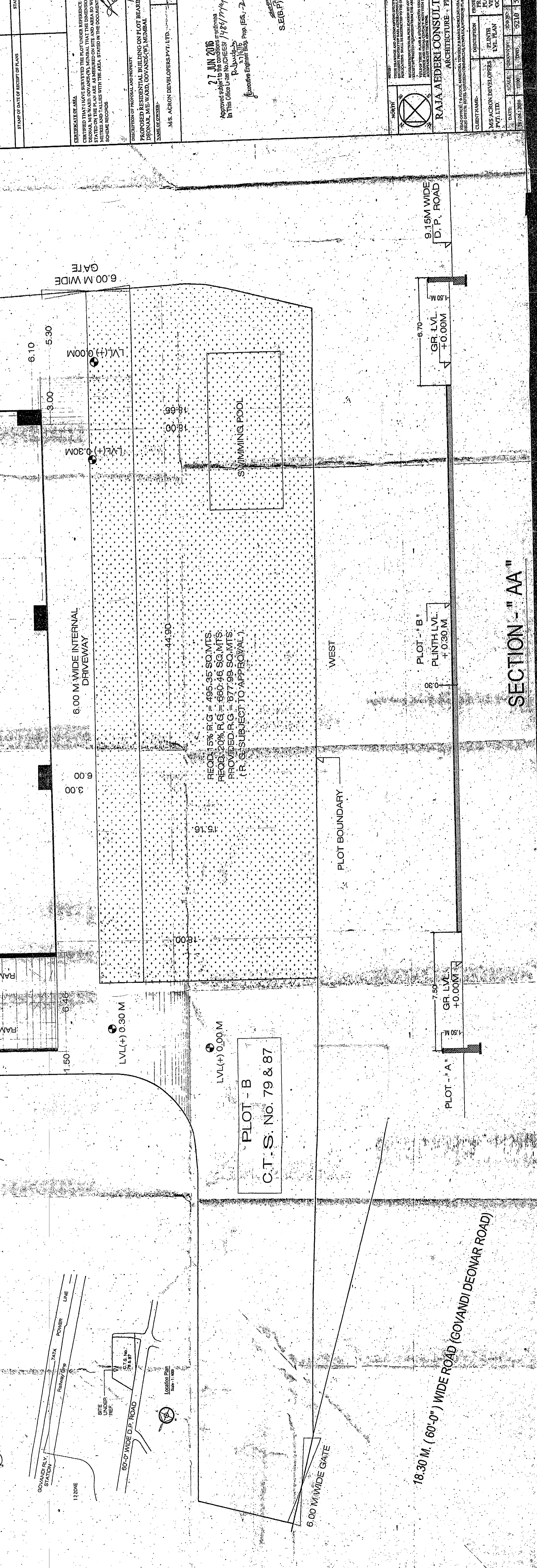
BLOCK PLAN SCALE - 1:500