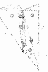
R.G. AREA DIAGRAM