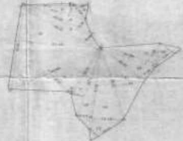
PLOT AREA CALCULATION