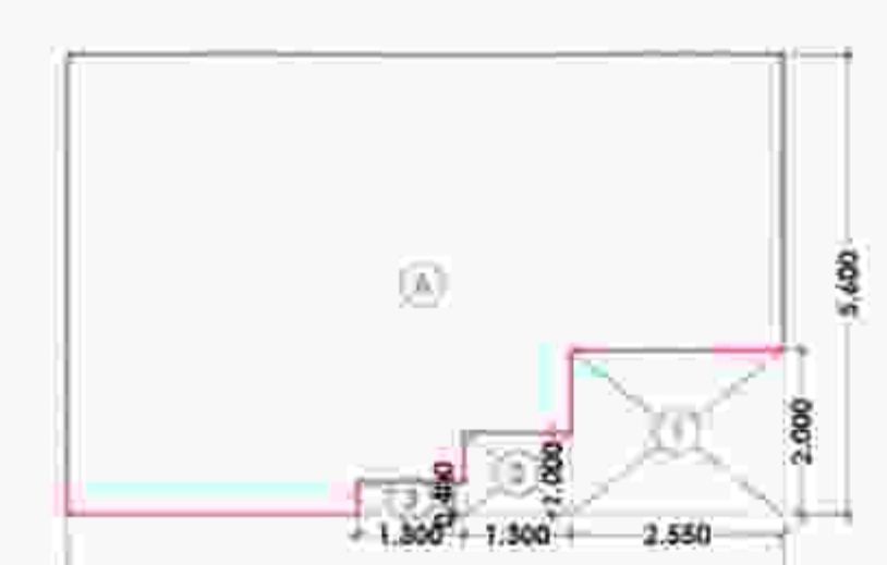
AREA DIAGRAM OF DRIVER ROOM SCALE - 1:100