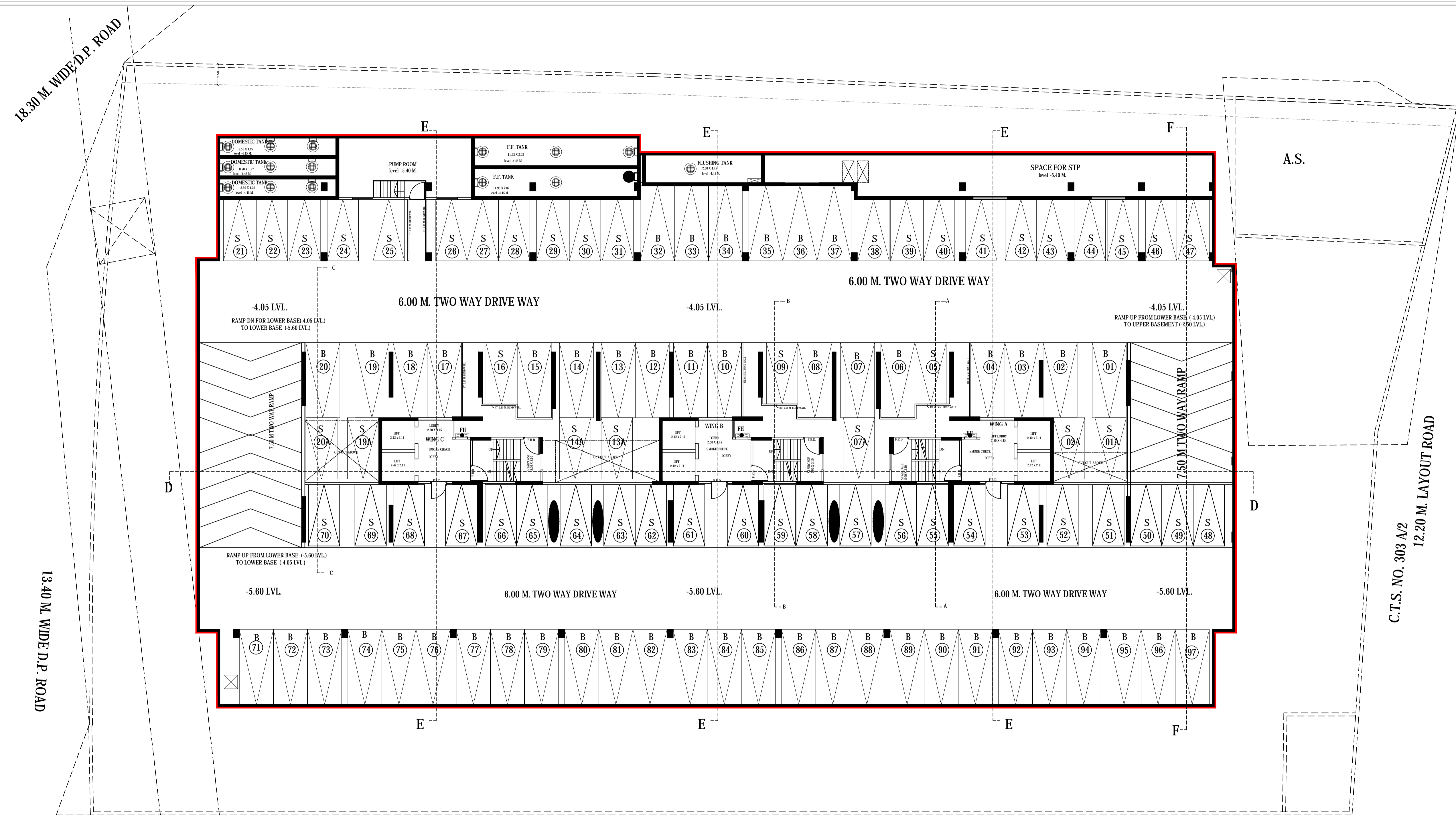
LOWER BASEMENT PLAN SCALE 1 : 200

SMALL PARKING = 47 NOS. BIG PARKING = 50 NOS. TOTAL = 97 NOS.