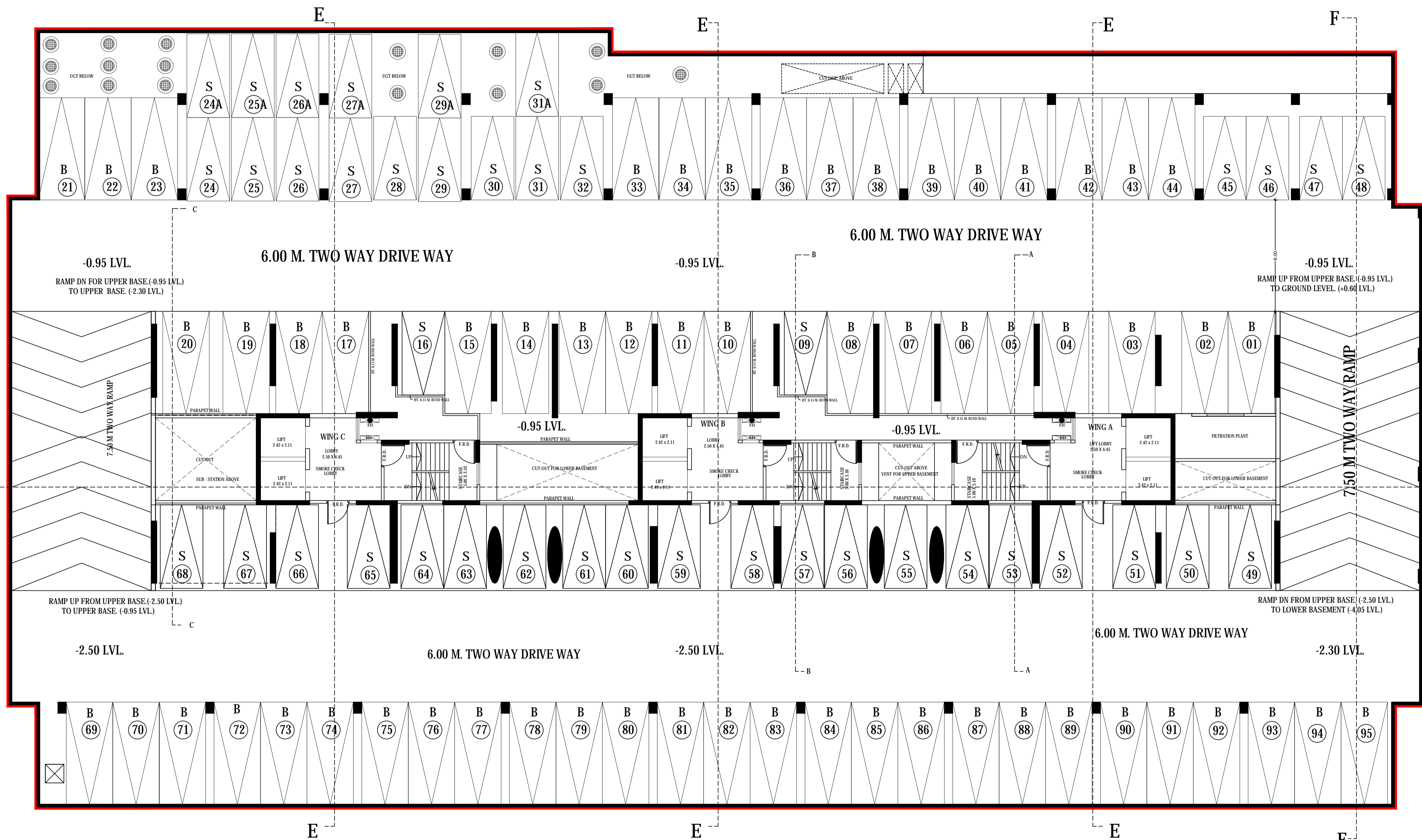
UPPER BASEMENT PLAN SCALE 1 : 200 SMALL PARKING = 35 NOS. BIG PARKING = 60 NOS. TOTAL = 95 NOS.