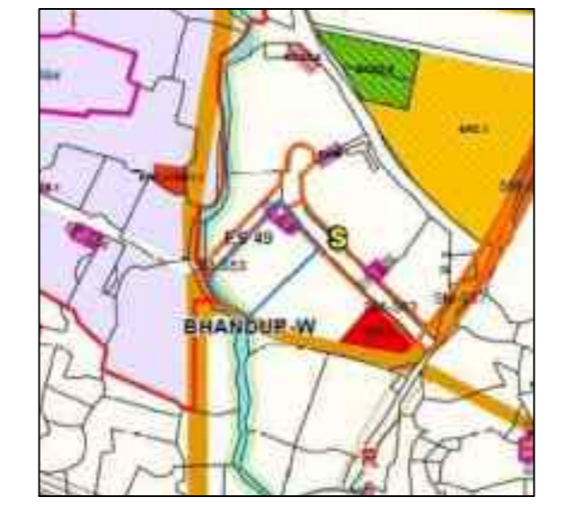
LOCATION PLAN SCALE 1 : 4000

PROP. 18.90 M. WIDE D.P. ROAD C.T.S. NO. 303 B/2