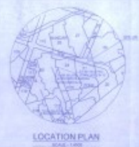
LOCATION PLAN SCALE - 1:500