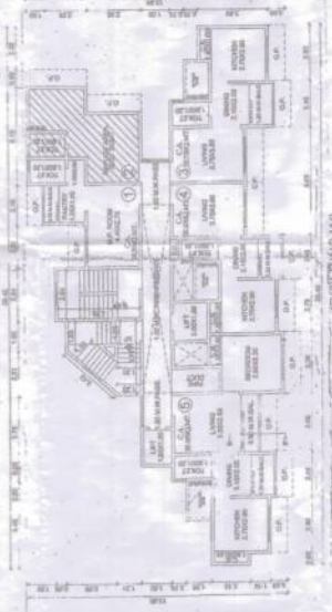
(BUILDING 'A') REFUSE FLOOR PLAN @ 8TH FLR SCALE: 1/8" = 1'-0"