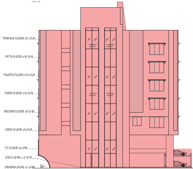
WEST SIDE ELEVATION SCALE 1:100