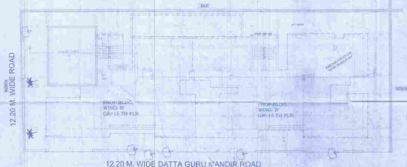
GROUND FLOOR PLAN (WING - 'A' & 'B')