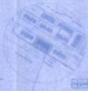
LOCATION PLAN SCALE: 1:100