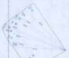
FLOT AREA CALCULATION