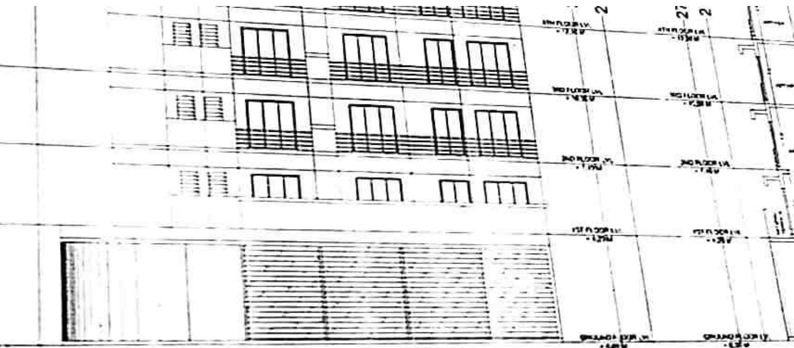
15.00 MT ROAD SIDE ELEVATION