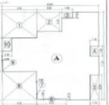
FENCE LAYOUT AREA DIAGRAM SHEET FLOOR