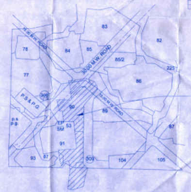
SITE UNDER REFERENCE