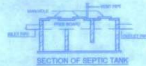
SECTION OF SEPTIC TANK