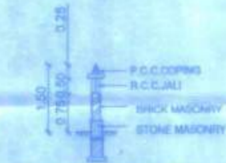
SECTION OF COMPOUND WALL