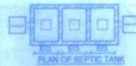
PLAN OF SEPTIC TANK