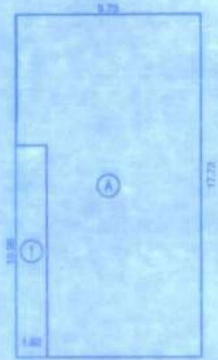
BU/UP AREA DIAGRAM (GROUND TO FOURTH) (SCALE - 1:200)