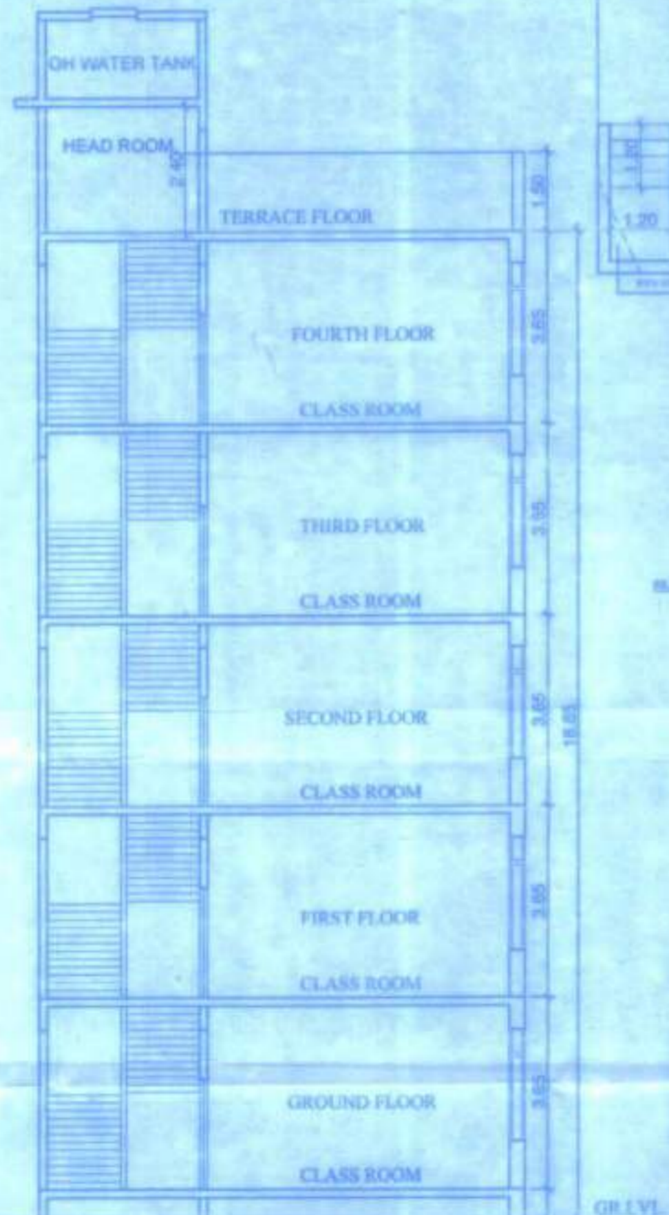
SECTION A - A (SCALE - 1:100)

संस्कृत नगरां मंडळी कुध्मलित रंगाने दुकली दाखविल्याप्रमाणे व संस्कृत शरीर प्रमाणपर ३. कडोसा / नरवि / बाण / ३३ / २०१२-१२ / २२३१६ दिनांक २२/०४/२०१६ दिलेला अट्टरमाणे