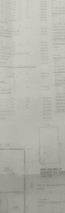
BASEMENT PLAN SCALE 1/8" = 1'-0"