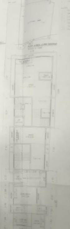
1ST FLOOR PLAN SCALE 1/8" = 1'-0"