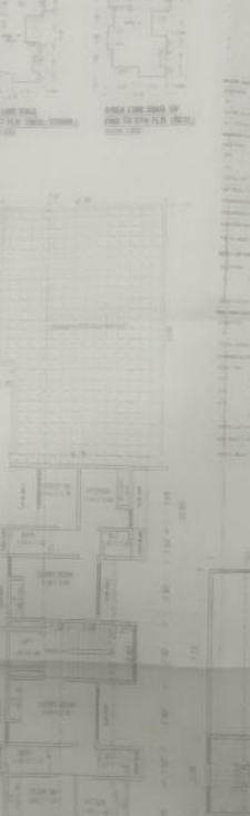
3RD FLOOR PLAN SCALE 1/8" = 1'-0"