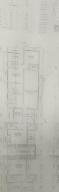
2ND FLOOR PLAN SCALE 1/8" = 1'-0"