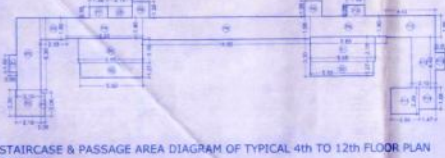
STAIRCASE & PASSAGE AREA DIAGRAM OF TYPICAL 4th TO 12th FLOOR PLAN SCALE: 1:200