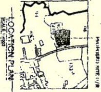
LOCATION PLAN SCALE: 1/200