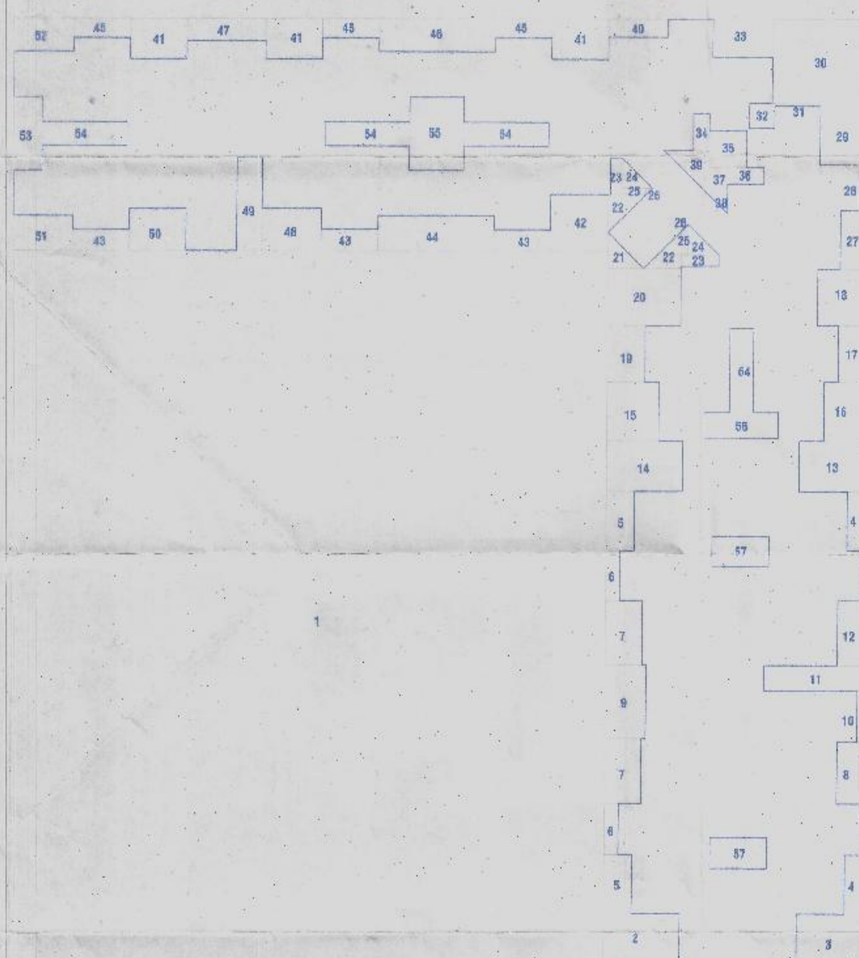
AREA DIAGRAM & CALCULATION OF FIRST, THIRD, FIFTH & SEVENTH FLOOR (EXIST.)