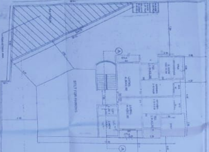
AS PER NEW D.P. 94 WIDE ROAD - 54.00 SQ.M. WIDE ROAD GROUND FLOOR PLAN