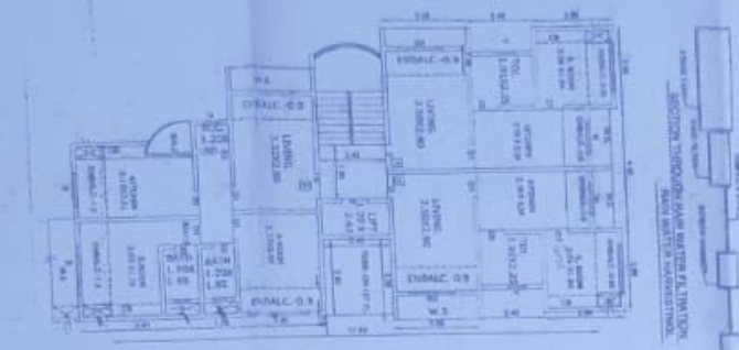
TYPICAL FLOOR PLAN FIRST TO FORTH FLOOR