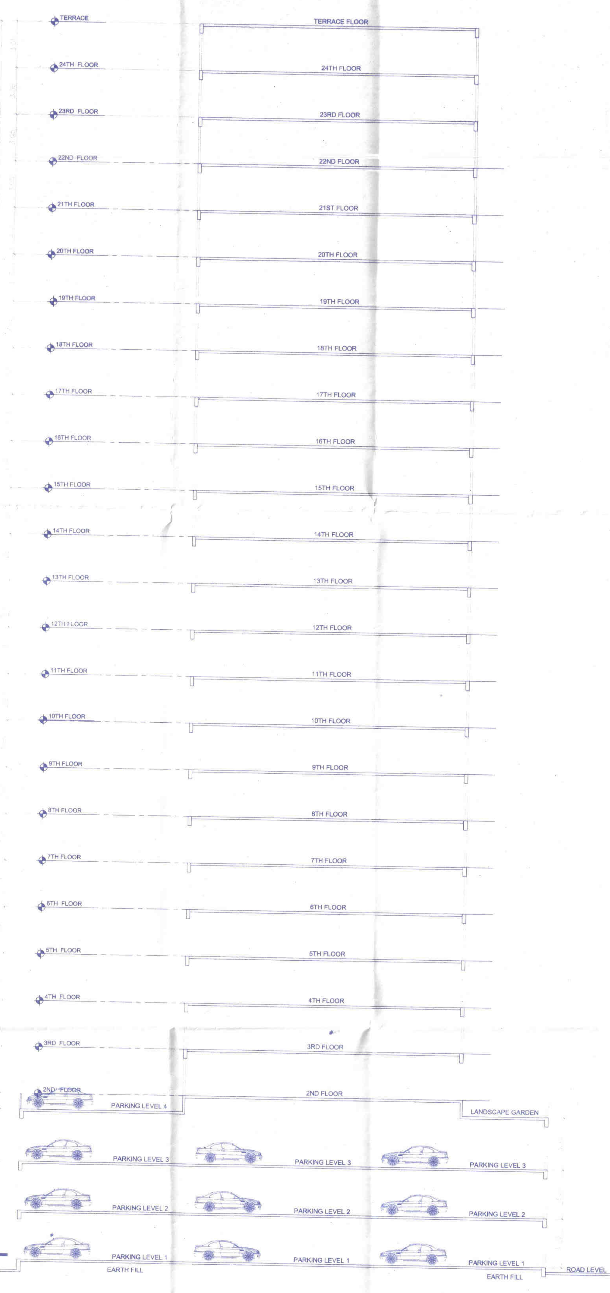
TYPICAL SECTION TOWER H