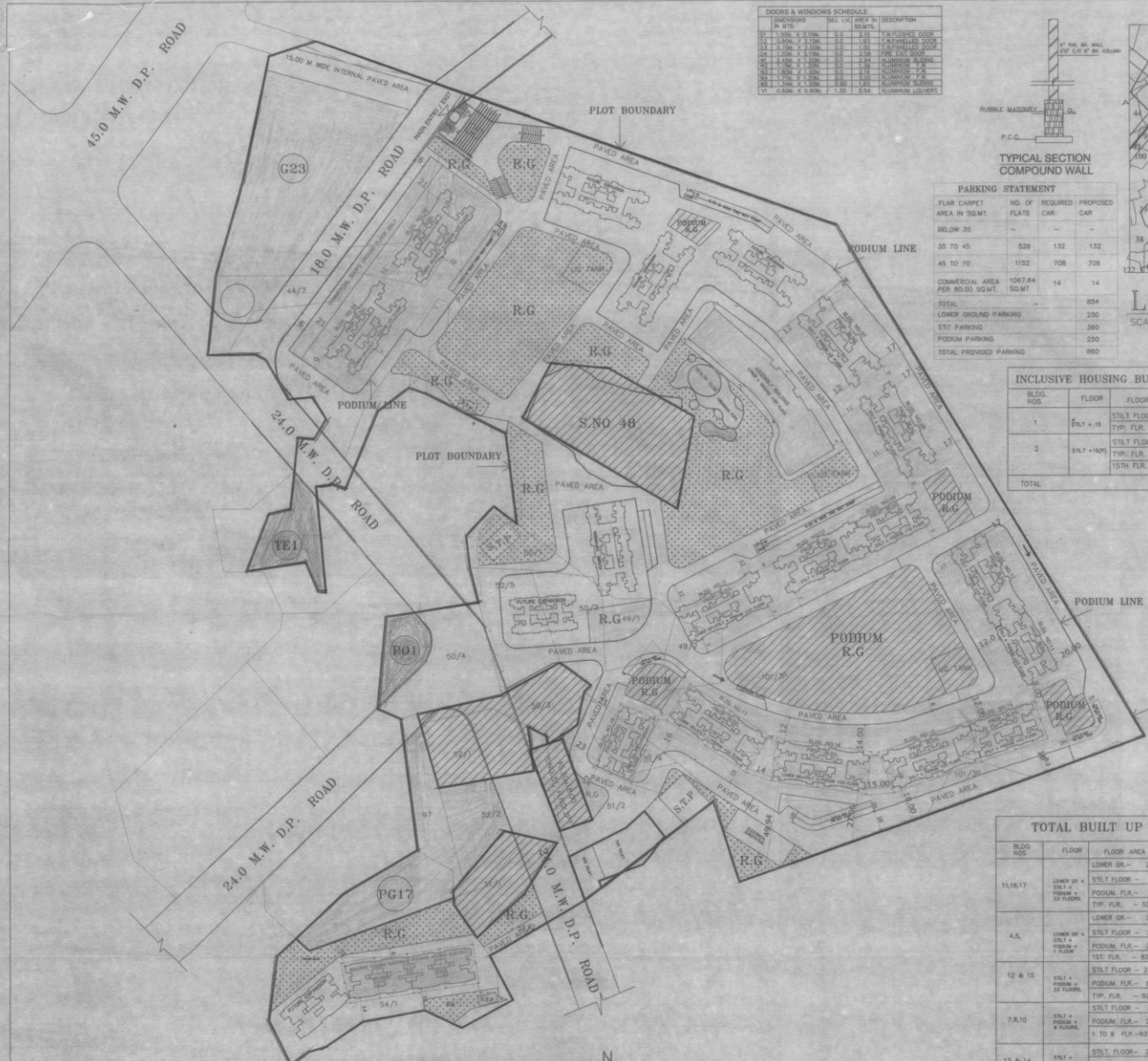
LAYOUT PLAN SCALE-1:1000