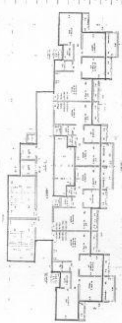
2ND TO 17TH FLOOR AREA CALCULATION

SCALE & STAMP OF ARCHITECT PROJECT NO. 10000 DATE: 10/10/2008 DRAWN BY: [Signature] CHECKED BY: [Signature] PROJECT: [Signature]