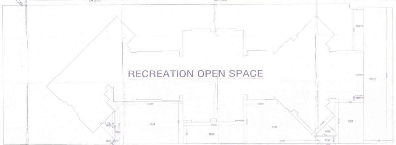
RECREATION OPEN SPACE AREA CALCULATION SCALE - 1 : 200

PERMISSIBLE RECREATION OPEN SPACE AREA = 1693.212 SQM PROPOSED RECREATION OPEN SPACE AREA = 1759.628 SQM