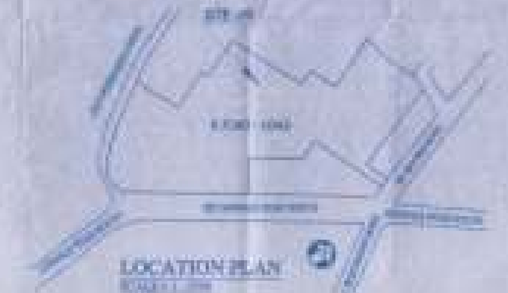
Location Plan (as per IOD)